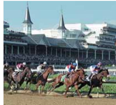
Churchill downs.

competitions, which have really taken on a lively following. We'll broadcast the robotics competition so that all can view it from Pepper's Tavern! We continue our efforts to bring the exhibitors our members want to see, such as Amatrol, American Technical Publishers, Dimension/Stratasy, Feedback, Goodheart-Willcox Publisher, Industrial Technologists Toolkit for Technology Management, Rixan Associates, SolidWorks and Z-Corp, and we expect them to be joined by other vendors and academic programs. We appreciate their support, and we encourage your organization to sign up for booth or a sponsorship. ●