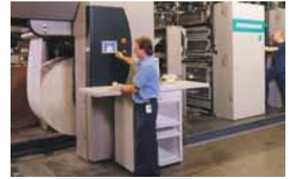
Magazine printer Publishers Press will host our Convention Tour and we'll finish the program with a CAD & Rapid Prototyping Workshop from Dimension/Stratasys

Please don't miss this year's industry tour and industry-led workshop. We'll see you in Louisville! ●