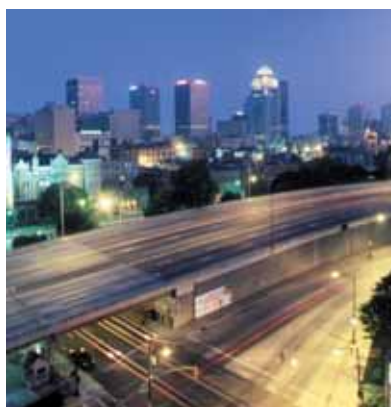
Louisville, Kentucky hosts the 2004 NAIT Convention. Louisville photos courtesy of www.gotolouisville.com

The 2004 NAIT Annual Convention is October 20 through 23 in Louisville, Kentucky and should be exceptional. Louisville is centrally located for most NAIT members and the convention is a great place to increase your networking connections, learn about the discipline, and contribute to its growth. Our host, the Hyatt Regency, is near fine dining, fast food outlets, and an urban mall, and other attractions like the Belle of Louisville, Churchill Downs, Kentucky Derby Museum, Louisville Slugger Museum and the Louisville Bats (this is a great tour), along with gambling on riverboats and across the river in Indiana