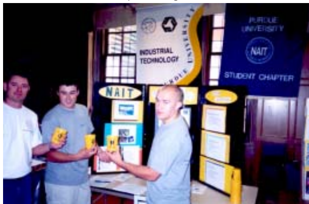
NAIT student chapter officers at the Purdue's Activities Carnival.

(Professional Association for Industrial Distribution) in order to attract more members with similar scholastic and career goals. Our group is now getting charged up for the construction of our robot for Nashville. Other upcoming events include officer elections, the senior banquet, and graduation.