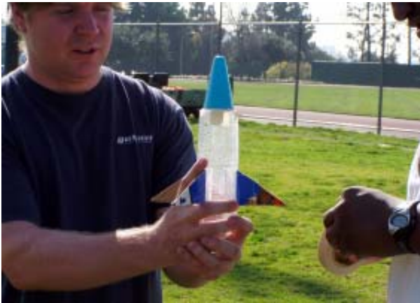
Two Cal State – LA students put some final touches to a pop bottle rocket.