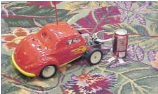
Iowa State's "Cyclone One" drove away with the grand prize in the first NAIT Student Division Tele-Operated Robotic Manipulator Contest

Eight UNI Chapter members attended the conference in Panama City Beach, Florida. While there the students participated in the IT/IQ Bowl and the first ever robotics competition. The Chapter is making plans for next year's conference in Nashville, TN and are brainstorming fundraising ideas, including an auction that's in the planning stages to be held after the New Year.